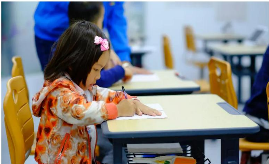
IB schools or international schools can provide students with just the kind of global education we need now. The alternative education model goes a long way to prepare children for the future. Here are 6 myths about IB schools debunked!