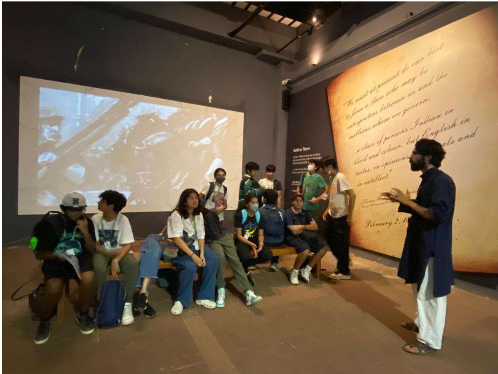
Time for observation and interpretation